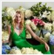
57Grand bridesmaids dresses